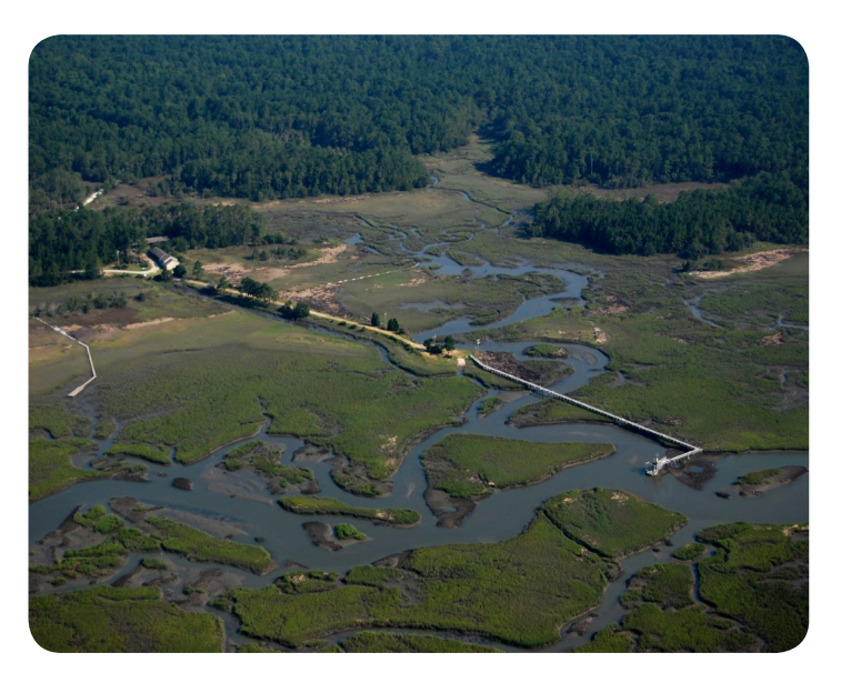
Aerial view of Oyster Landing, the NERR site where brackish water samples are regularly taken for research into dissolved organic carbon.

Traditionally, DOC samples are collected manually at remote sites and returned to the lab for direct analysis of carbon concentration. Unfortunately, this analysis is cost and labor intensive, meaning that collecting