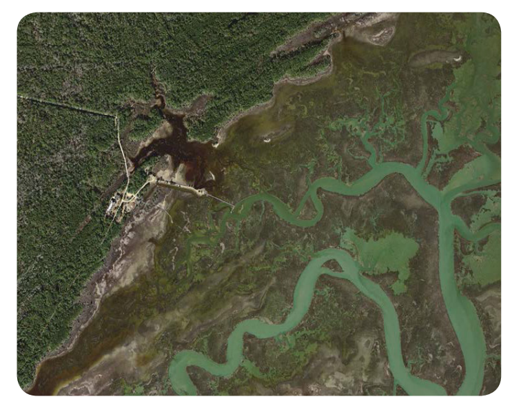
The National Estuarine Research Reserve System is a network of 28 protected areas established by partnerships between the National Oceanic and Atmospheric Administration and coastal states.