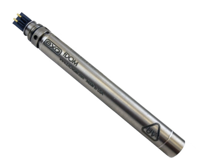
EXO's fDOM probe is a new development in sensor technology. It is the result of years of research and improvements in both water monitoring and materials science.